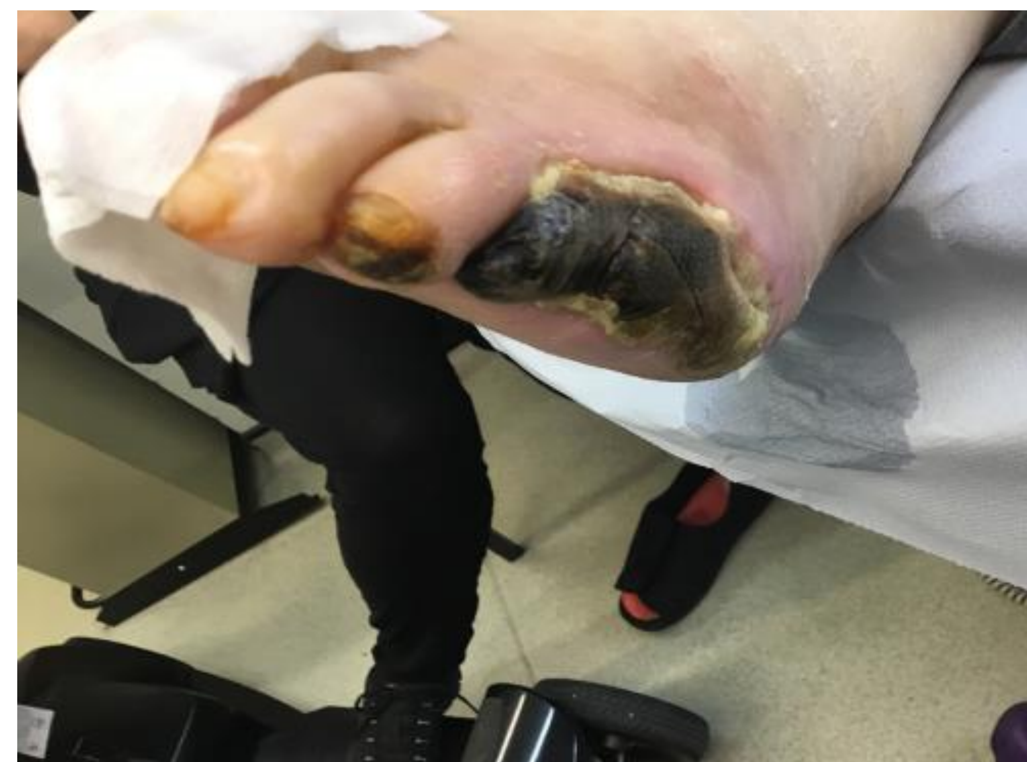
Initial Presentation (Day 0)

The ulcer was managed following local protocols, using an enzyme alginogel as the primary dressing and a 7-day course of flucloxacillin for infection treatment. To address the odour, Cinesteam cinnamon odour-control dressing was applied as a secondary dressing.